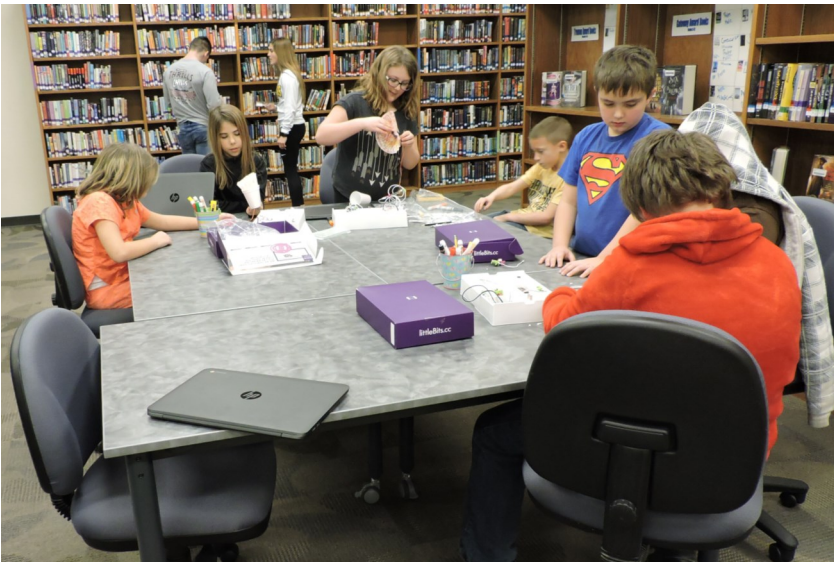
The third graders enjoy using the library's maker space.