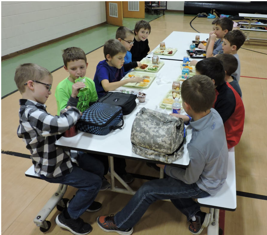
Some of the third grade boys chat with they eat their lunches.