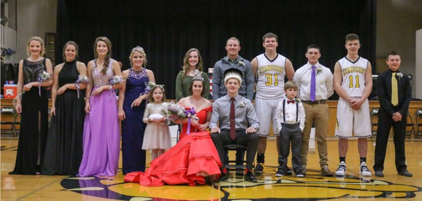
The entire Sportswarming court