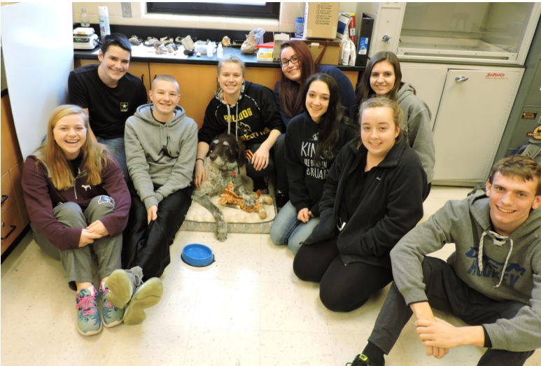
Several students in science class enjoy Magellan's presence.

was there waiting with a look on his face that said, 'where have you been?' We knew he was an expert geographer and master explorer. In his younger years, no fence could fully contain Magellan, and he would periodically go on 'expeditions.' These have waned over the years, but he is still known to slip out the door for an adventure. Magellan is a master at Animal Assisted Therapy and has been visiting schools since 2010. He was a regular at several elementary schools in Texas and at Eugene Field Elementary (Maryville) and West Nodaway High School (Burlington Junction) in Missouri. His therapy work started as an ARF dog (Animal Reading Friend) where 1 st – 3 rd graders read to Magellan out loud. There was no judgement – only encouragement, and reading levels improved over the year. At the high school level, Magellan is here to reduce stress and be a calming influence in the classroom. Animals in the classroom facilitate an atmosphere of trust, nurturance, and relationship building. Animals actually help a person to focus on a task because of an interest in interacting with the pet. The therapy animal is a nonjudgmental companion in the process of learning and development, and science proves that these benefits are indisputable. This is also a mutually beneficial relationship for students and Magellan because it